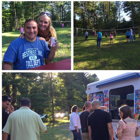
Bestpass Company Picnic 2015

Did you know that August is known as National Picnic Month? The Bestpass team enjoyed a night of fun at the annual Bestpass Company Picnic. Fun was had by all, there was a bouncy bounce to keep the kids busy, intense games of volleyball and beanbag toss, and an ice cream truck to cap off the night. We can't wait to get the gang together again! Be sure to check out the Bestpass Instagram to check out all of the Bestpass fun - click the picture to see!